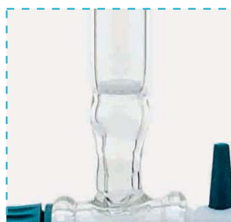
Chromatographic columns with sintered frit, pore size 1.