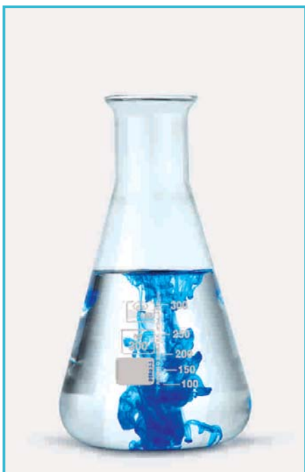
"clear" - "narrow neck"