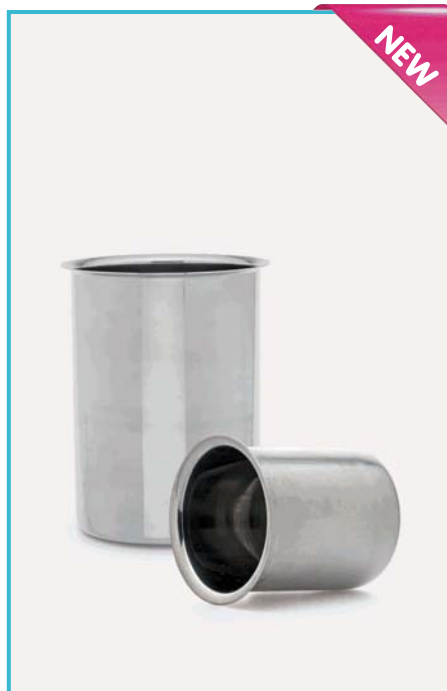
"st. steel" - "low form"