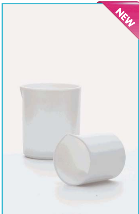
"PTFE" - "low form"