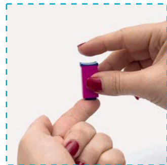
Hold the lancet firmly against selected finger site.