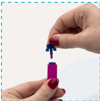
Twist off the protective cap/safety cover