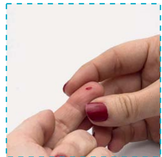
Gently massage the finger to obtain the required blood.