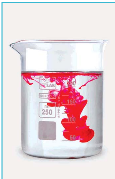
"glass" - "low form"