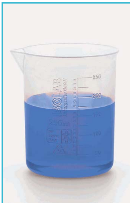
"P.P" - "embossed scale"